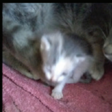
"Taweret" our Soon Gundy. bandcamp. com

You may find these dimensions hard to reach after initial encounters.